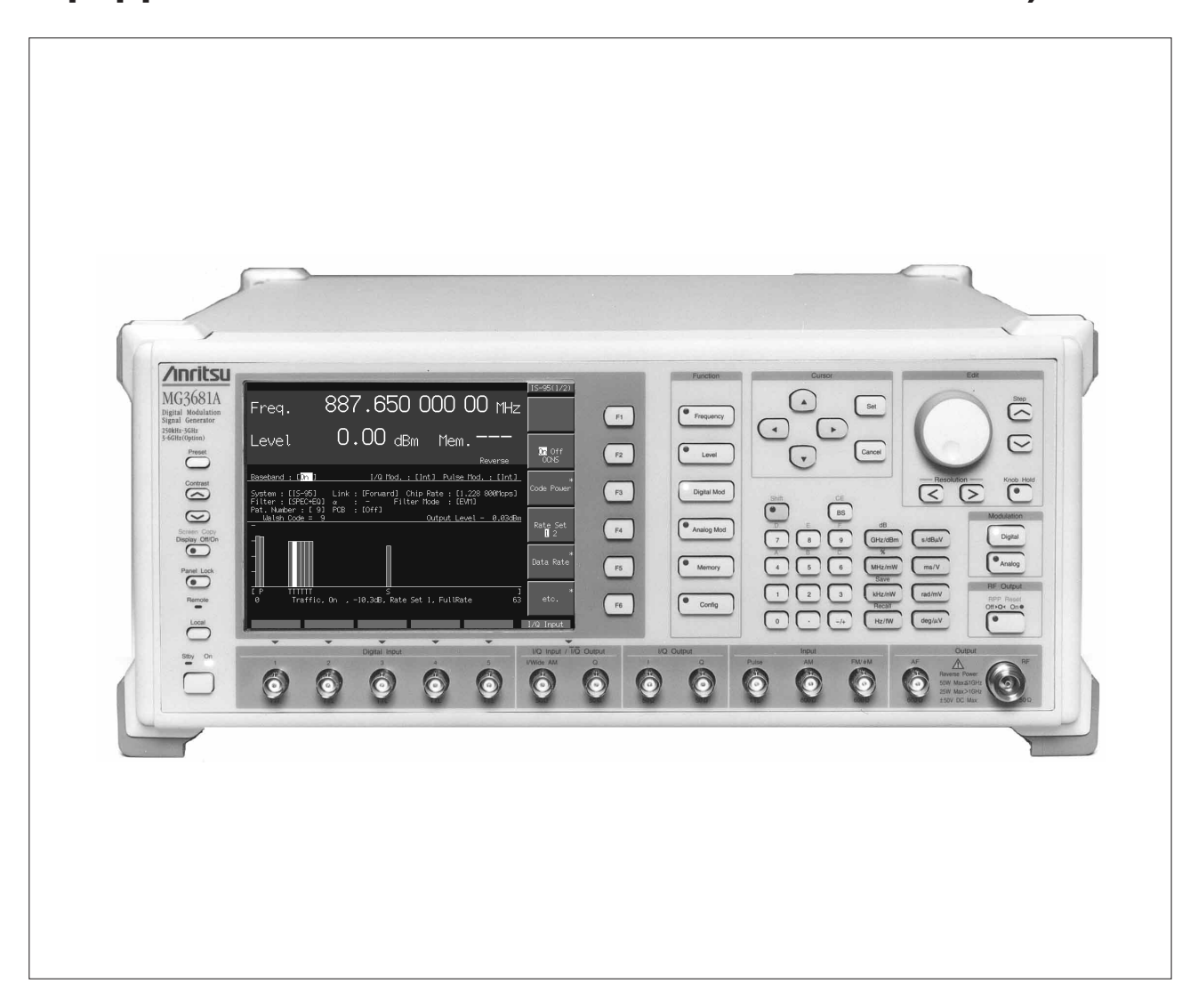
For IS-95 RF Devices Evaluation

(For MG3681A Digital Modulation Signal Generator equipped with MU368040A CDMA Modulation Unit)