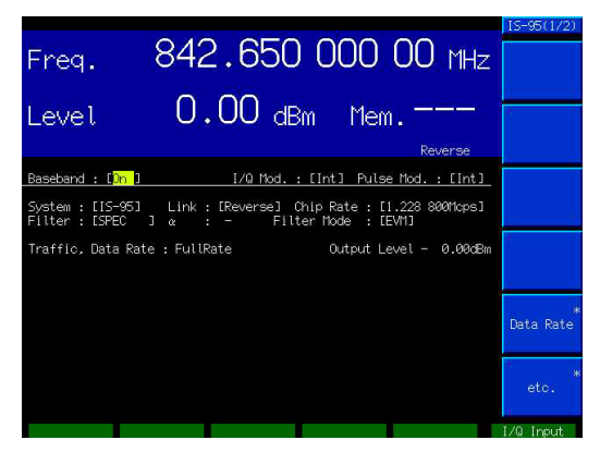
Modulation screen (reverse link)